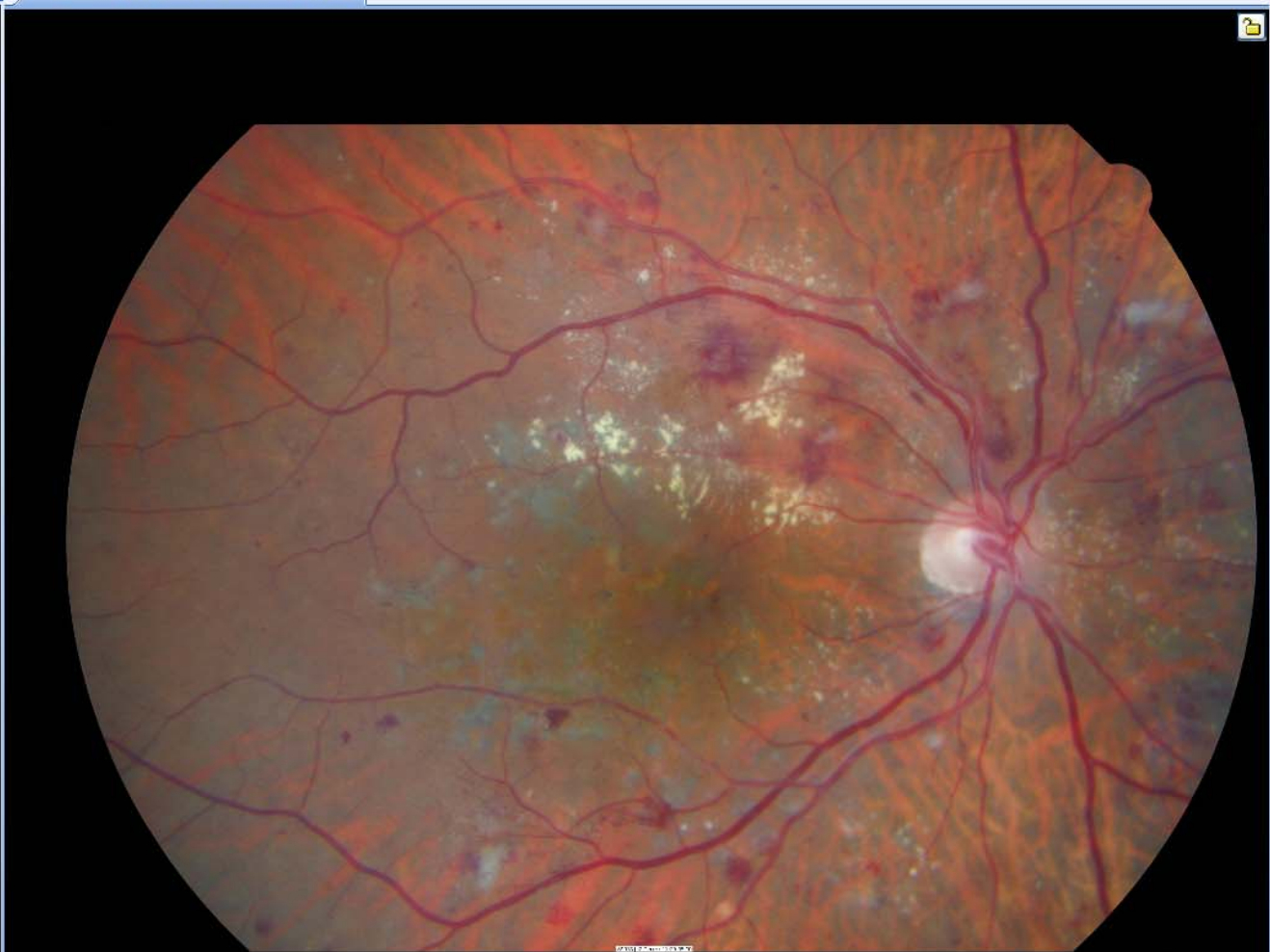
Example of a retinal image with diabetic retinopathy, the red patches are haemmorages Which over time and left untreated can lead to blindness.